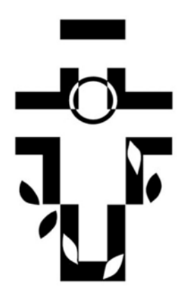
Growing in Spirit, Community, and Service

First Sunday of Advent November 27, 2022