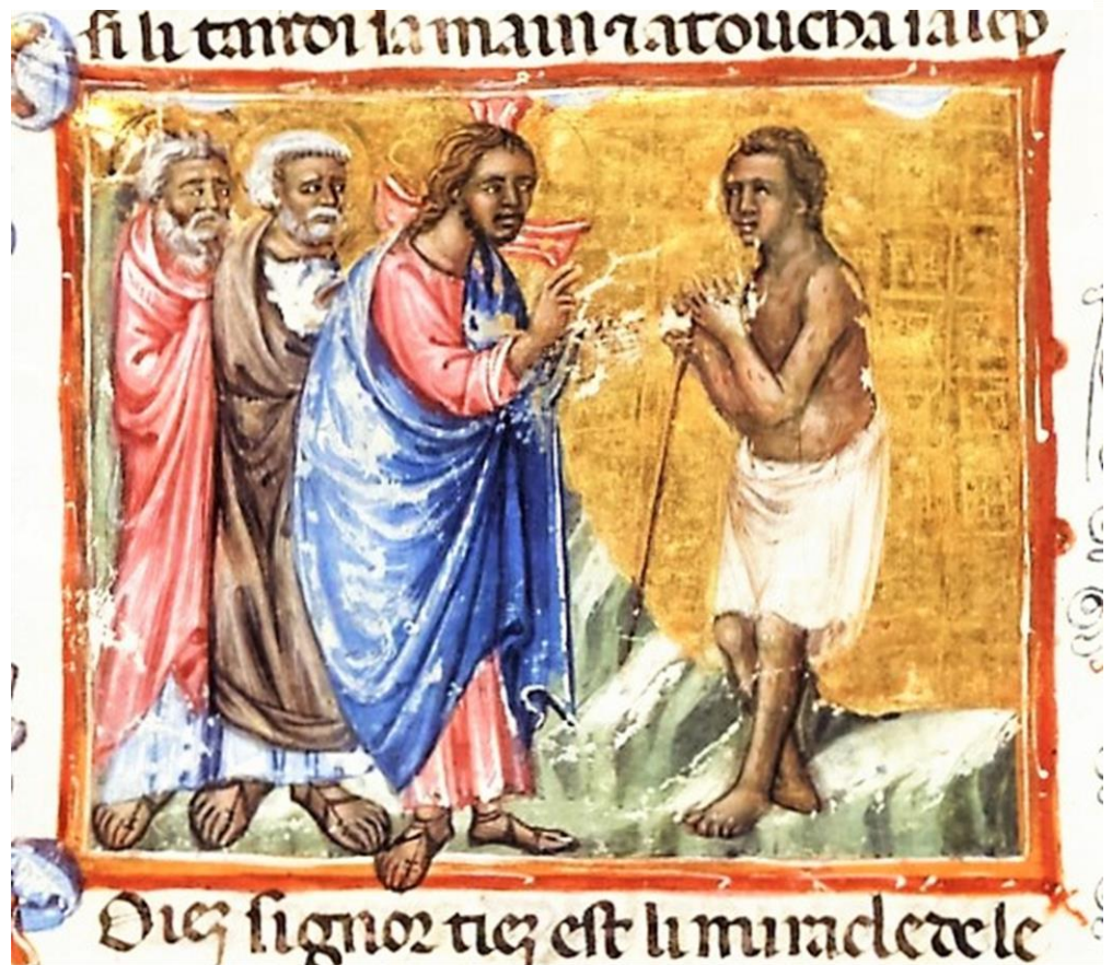
"Jesus Heals a Leper", From the manuscript Sermons of Maurice de Sully , Italian (Milan or Genoa), 1320-1330. Paris, Bibliotheque nationale de France, MS Francais 187, fol. 6v.