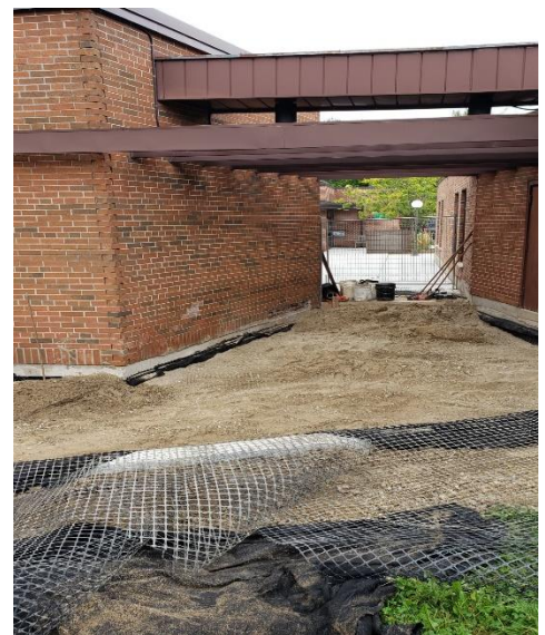
It won't be long: front door to parking lot!