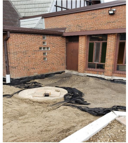
Coffee rush and Children’s Liturgy access

There is a saying that goes something like this: “Good things come to those who wait.” Patience is a virtue, and you have been incredibly patient. But, good things are on the horizon. Coffee after the 10:00 am mass will resume in the coming weeks as well as Children’s Liturgy of the Word. The first School Mass this year is on Wednesday the 25 th of September. It won’t be too long before we can reopen the main door of the church and walk a smooth path to the parking lot.