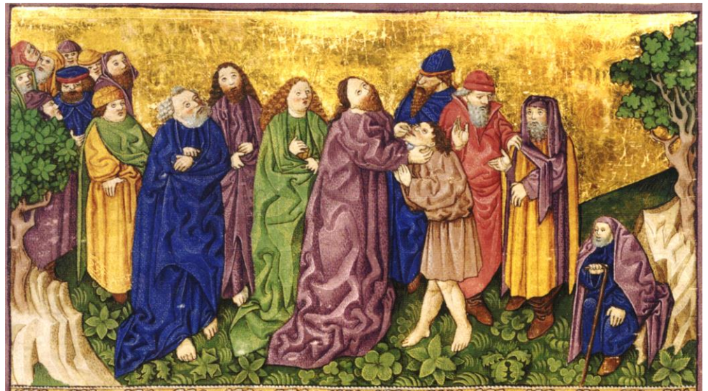
Healing of the Deaf Mute, page 55 from the Ottheinrich Folio 055v Mc7C, (c. 1425-1430), German, Ottheinrich-Bibel, Bayerische Staatsbibliothek. Common domain.

Be opened. Oh if only we might be! Speak to a heart that's closed in on itself: 'Be opened and the truth will set you free', Speak to a world imprisoned in its wealth: 'Be opened! Learn to learn from poverty', Speak to a church that closes and excludes, And makes rejection its own litany: 'Be opened, opened to the multitudes For whom I died but whom you have dismissed Be opened, opened, opened,' how you sigh And still we do not hear you. We have missed Both cry and crisis, we make no reply. Take us aside, for we are deaf and dumb Spit on us Lord and touch each tongue-tied tongue.