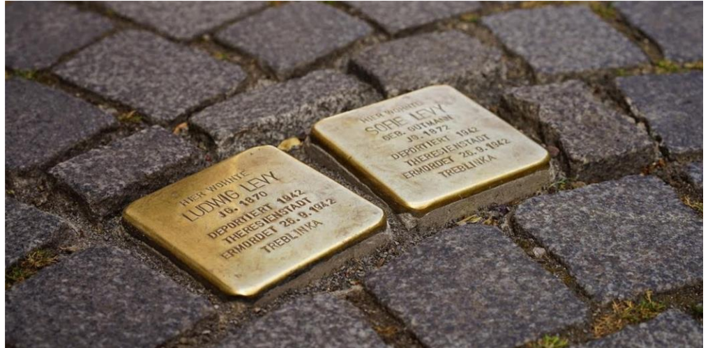
Stolpersteine (Stumbling Stones), by Gunter Demnig, concrete and brass. Contemporary Holocaust Memorials installed throughout cities and villages in Europe.