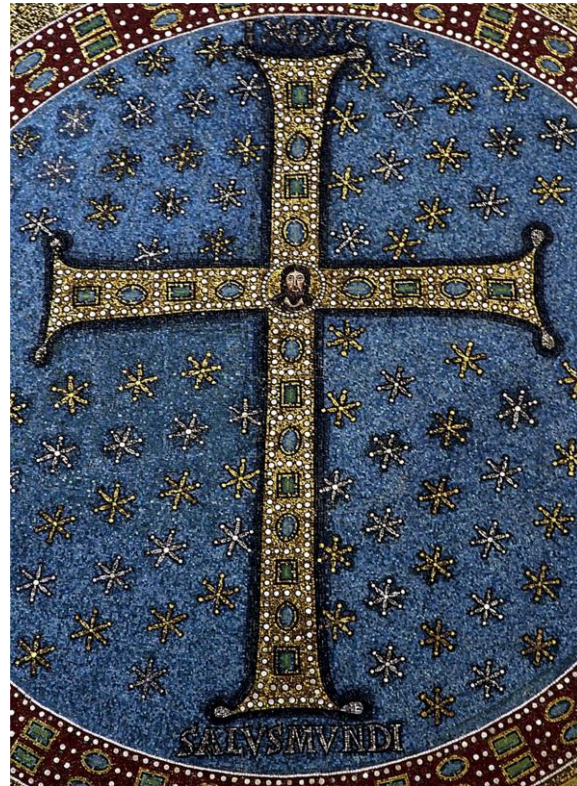
Detail of a mosaic, Basilica of Sant' Apollinare in Classe, Ravenna (c.549).