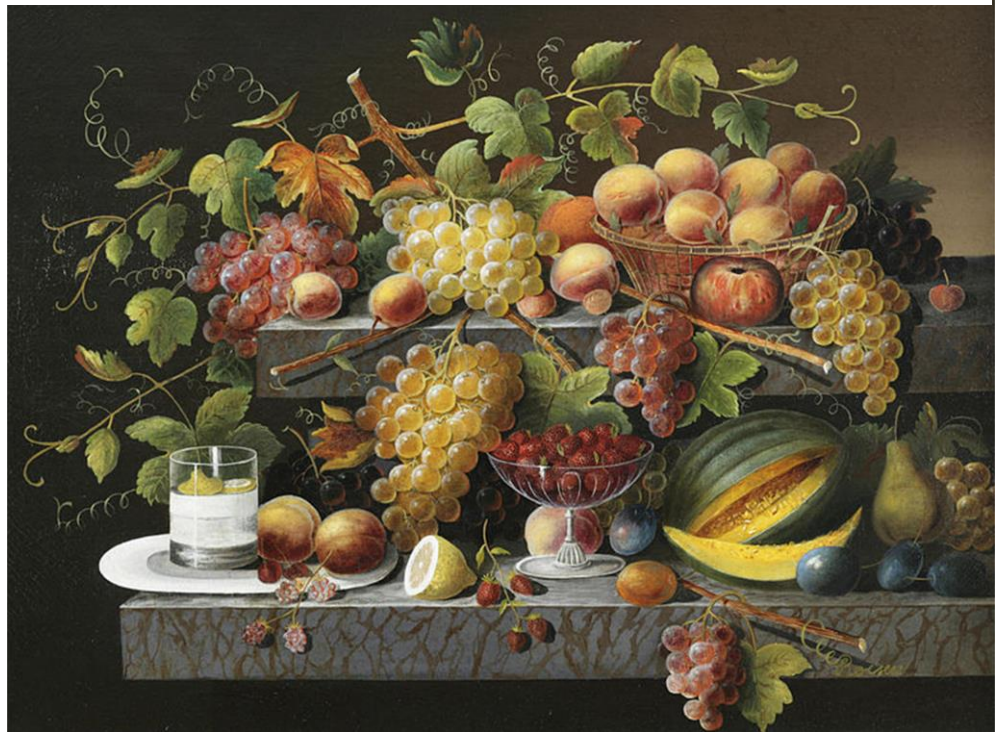
Still Life of Fruit by Severin Roesen, (1815-1872), Oil on Canvas, Unknown date.