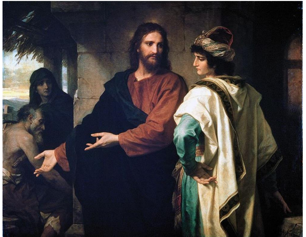
Christ and the Rich Young Ruler. (1889), Heinrich Hofmann (1824-1911). Purchased by John D Rockefeller Jr, now residing at Riverside Church, New York. Public domain.