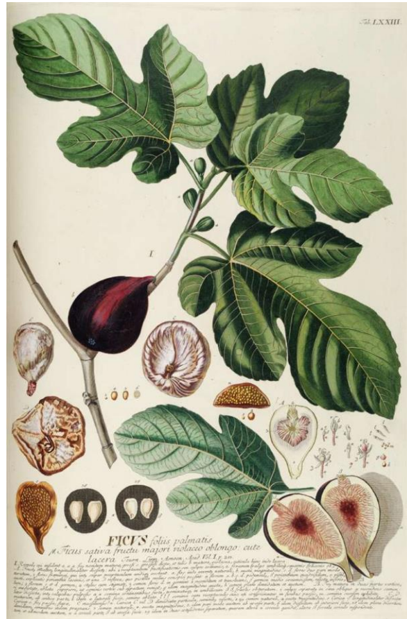
By Trew, C.J - Plantae selectae quarum imagines ad exemplaria naturalia Londini, in hortis curiosorum nutrit, vol. 8: t. 73 (1771) [G.D. Ehret] Public Domain. https://commons.wikimedia.org/w/index.php?curid=22318968 .