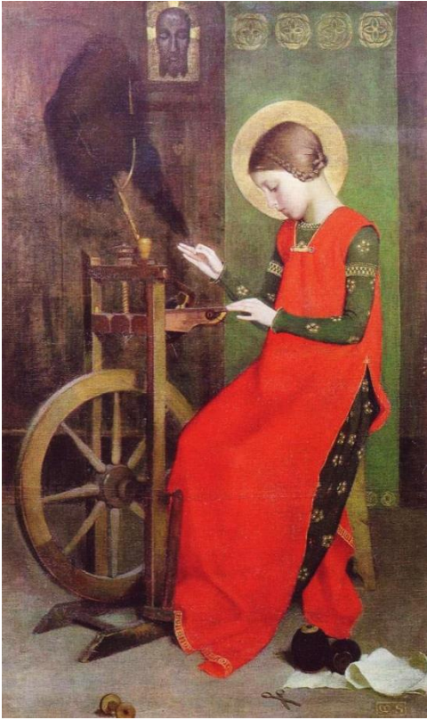
Marianne Stokes (1855-1927), Saint Elizabeth of Hungary Spinning for the Poor (1895), oil on canvas. Private collection.

Born in 1207, Elizabeth was the second child of Andrew II and Gertrude of Hungary. As a royal daughter, even in her infancy the issue of marriage was an important one. Ultimately, she was betrothed to Landgravin Hermann I of Thuringia.