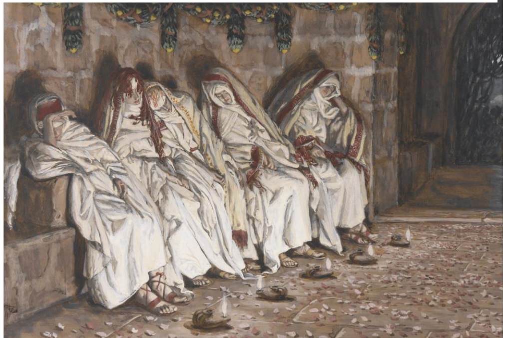
James Tissot (1836-1902), The Wise Virgins (Les vierges sages) , 1886-1894. Opaque watercolour over graphite on gray wove paper. Brooklyn Museum.

Face to face with our limits, Blinking before the frightful Stare of our frailty, Promise rises Like a posse of clever maids Who do not fear the dark Because their readiness Lights the search. Their oil Becomes the measure of their love, Their ability to wait— An indication of their Capacity to trust and take a chance. Without the caution or predictability Of knowing day or hour, They fall back on that only Of which they can be sure: Love precedes them, Before it No door will ever close.