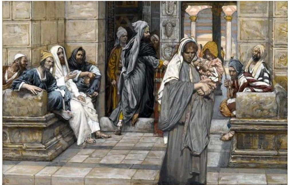
The Widow's Mite -Le denier de la veuve (c.1886 - 1894) by James Tissot (1836-1902), gouache over graphite on gray wove paper