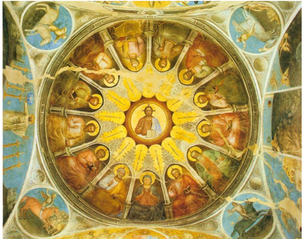
Descent of the Holy Spirit upon the Apostles (1375-1376). Giusto de' Menabuoi (1320-1393). Fresco in the Baptistry of the Duomo of Padua.

We celebrate the coming of the Spirit who comforted the Apostles by resting upon them in the form of fiery tongues. Blessed forever.