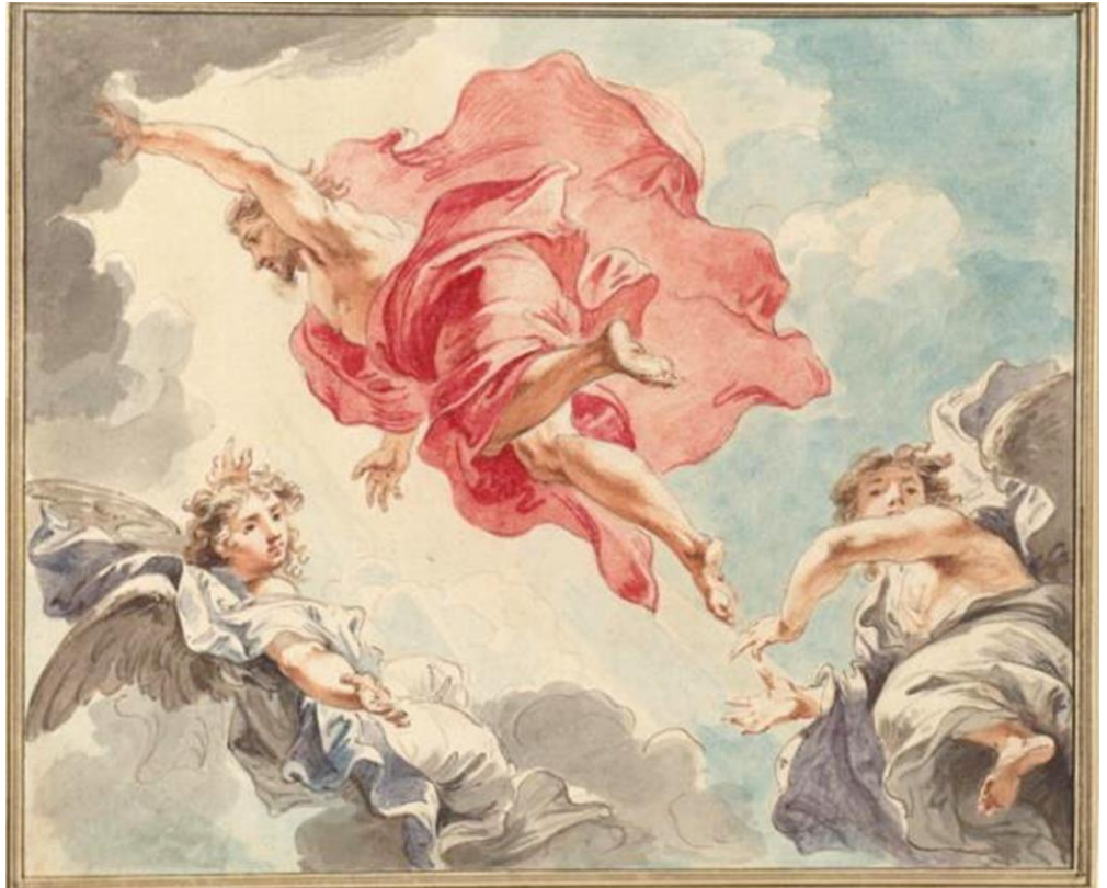
The Ascension of Christ (1751), Peter Paul Rubens, Dutch (1577-1640). Watercolour. Courtauld Institute of Art. Acc# D.1978.PG.428.20