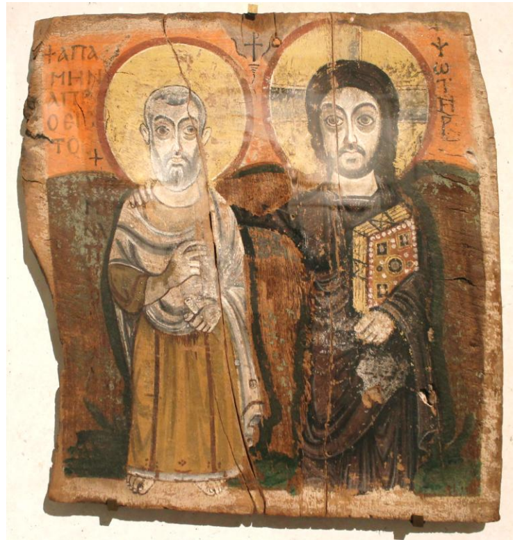
Icon of Christ and St. Menas (6-7 th C.). Coptic. Discovered in Bawit, Egypt. Wax paint on wood. Louvre Museum. Public Domain. Source: Wikicommons.