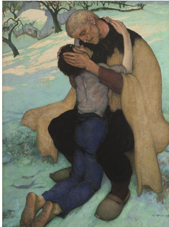
The Return of the Prodigal Son (1920), Anto Carte (Belgian). Public Domain.