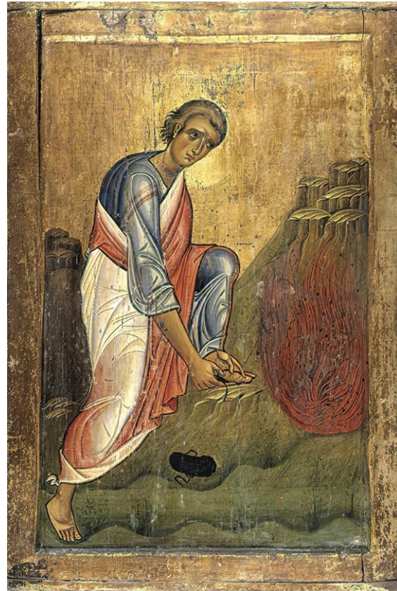
Moses before the Burning Bush, early 13th C. Tempura on cloth. St. Catherine's Monastery at God-trodden Mount Sinai. To learn more: https://mused.com/stcatherines/