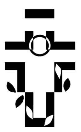
Growing in Spirit, Community, and Service

Mass Times Sunday Eucharist Saturday Vigil: 5 pm Sunday: 8:30 am, 10 am and 12 noon