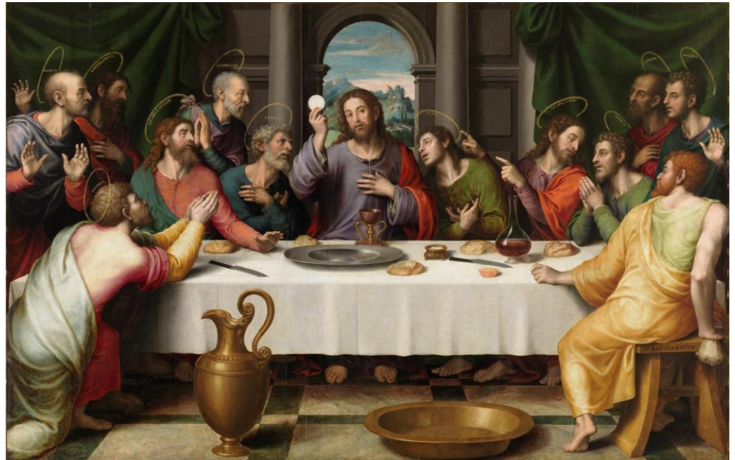
La Última Cena ~ The Last Supper (c. 1562), Juan de Juanes ( -1579). Oil on panel. Museo del Prado. Public domain.

Lord Jesus, we offer you to your Father, the world looks on and does not understand.