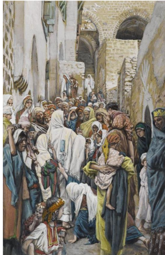
"Woman with an issue of blood" (1886-1894) by James Tissot (1836-1902), gouache over graphite on gray wove paper.