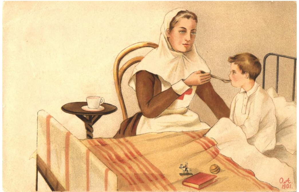
Nurse giving medicine to boy. Postcard. 1901.