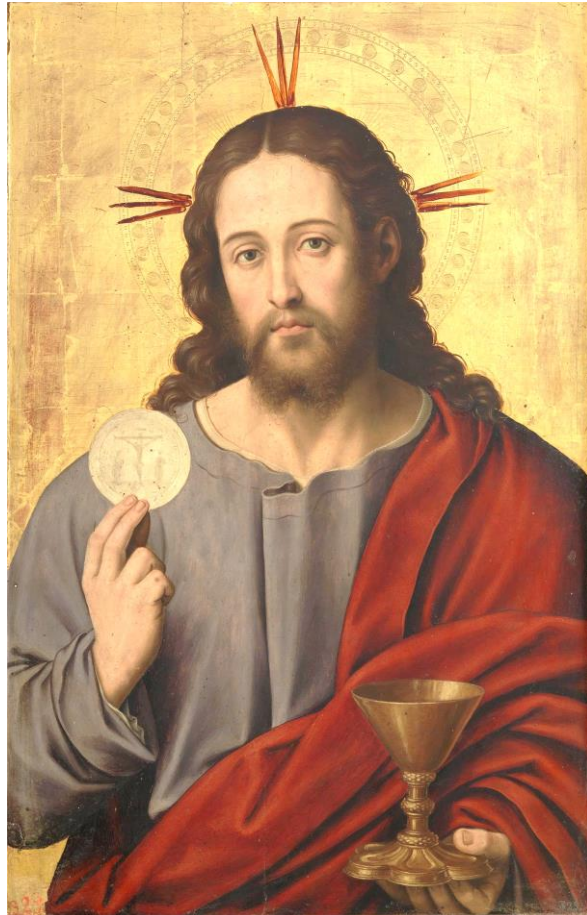
"Christ the Saviour with the Eucharist" (1545-1550), Juan de Juanes (c.1503/05-1579), Oil on panel. Museo del Prado.