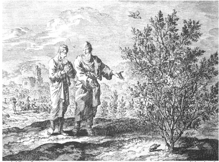
PARABLE OF THE MUSTARD SEED. MARK 4:30-32. JAN LUYKEN

“Parable of the Mustard Seed” by Jan Luyken (1649-1712). Etching from the Bowyer Bible (1791-1795), Bolton Museum, England. Harry Kossuth, photo. Electronic image created by Phillip Medhurst 10 August 2009.