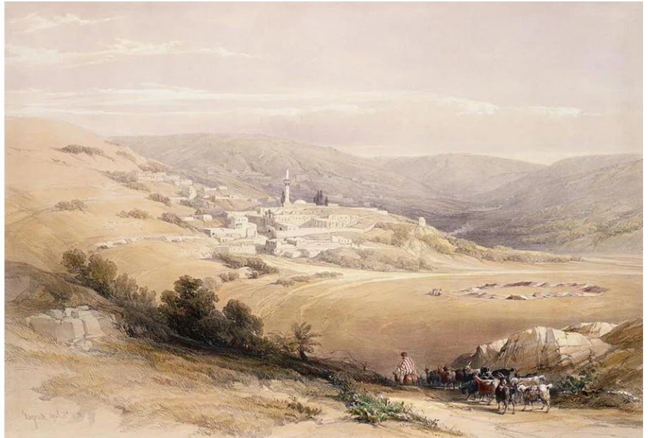
Nazareth, April 28 th, 1839, Painted by David Roberts (1796-1864), engraved by Louis Haghe (1806-85), plate 28 from Volume I of 'The Holy Land', Published in 1842

"A Prophet is not without honour; except in his hometown, and among his own kin, and in his own house." Mark 6:4