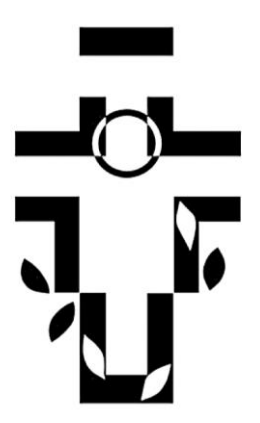
Growing in Spirit, Community, and Service

Mass Times Sunday Eucharist Saturday Vigil: 5 pm Sunday: 8:30 am, 10 am and 12 noon