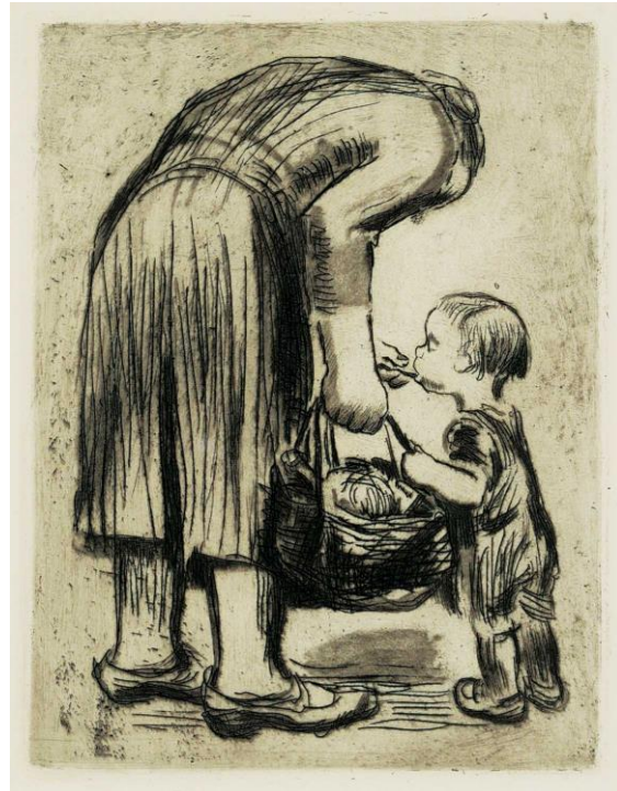
Käthe Kollwitz (1867-1945), Stehende Mutter, ihr Bublein fütternd , 1931.