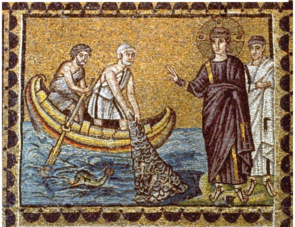
Christ calls Apostles Peter and Andrew as fishermen (VIth century AD), mosaic cycle, Basilica Saint Apollinare Nuovo Ravenna. Museum: San Apollinare Nuovo, Ravenna, Italy.