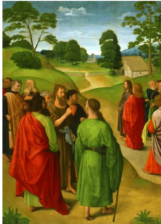
Saint John the Baptist pointing out Christ as the Lamb of God (1500-1510), by anonymous Master of the Saint John Altarpiece, Netherlands Oil on panel.

Beginnings— just tiny stirrings which disturb our even surface, prodding us into new and different shapes... claiming their place on our horizons— stretching us where we would not go— yet we must. Driven by life forces deeper than our dreams, we dare to rise and grasp towards the new young thing— not yet born— but insistent— like a tight seed bursting for life, carrying within it all the power of a woman's birthing thrust.