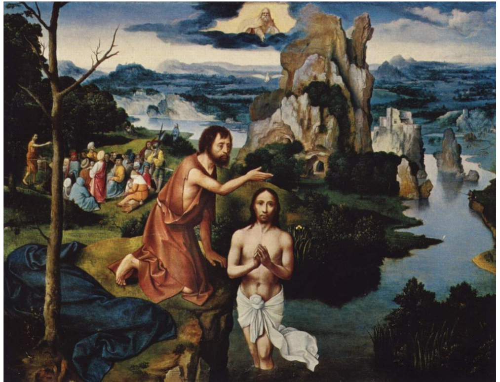
The Baptism of Christ (c. 1510), by Joachim Patinir (circa 1480-1524) Oil on panel.