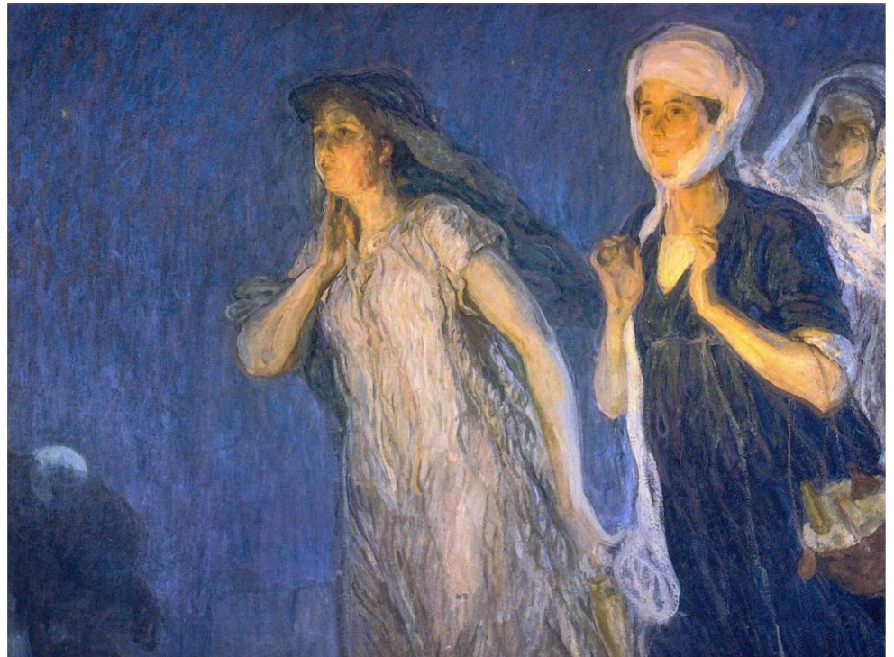
"The Three Marys" (1910), Henry Ossawa Tanner (1859-1937). Oil on canvas. Fisk University Art Galleries, Nashville, Tennessee.

"If you were not risen" by Brother Roger of Taizé