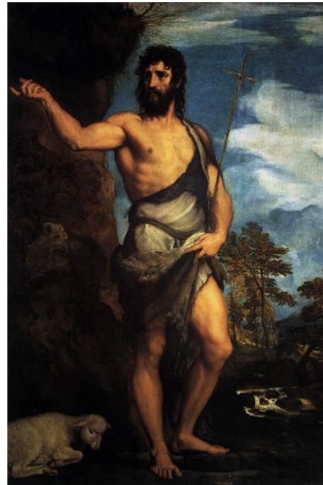
San Giovanni Battista (c. 1540-1542), Titian (1490-1576). Oil on canvas. Gallerie dell'Accademia, Venice.