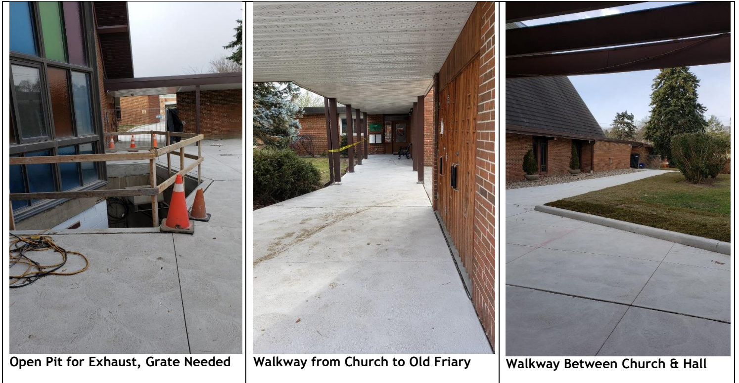
Open Pit for Exhaust, Grate Needed

The drainage of surface water from the courtyard and new walkways has been a considerable part of this project. The installation of the drainpipes involved excavations in front of the church and old friary. There is still a fair amount of cleanup to do.