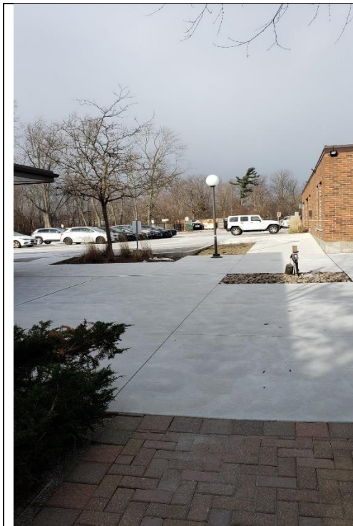
Walkway in front of Ministry Centre

By and large the walkways around the church are finished. The pavers, many of which were cracked and chipped, have been replaced with concrete. There are some finishing touches that still need attention.