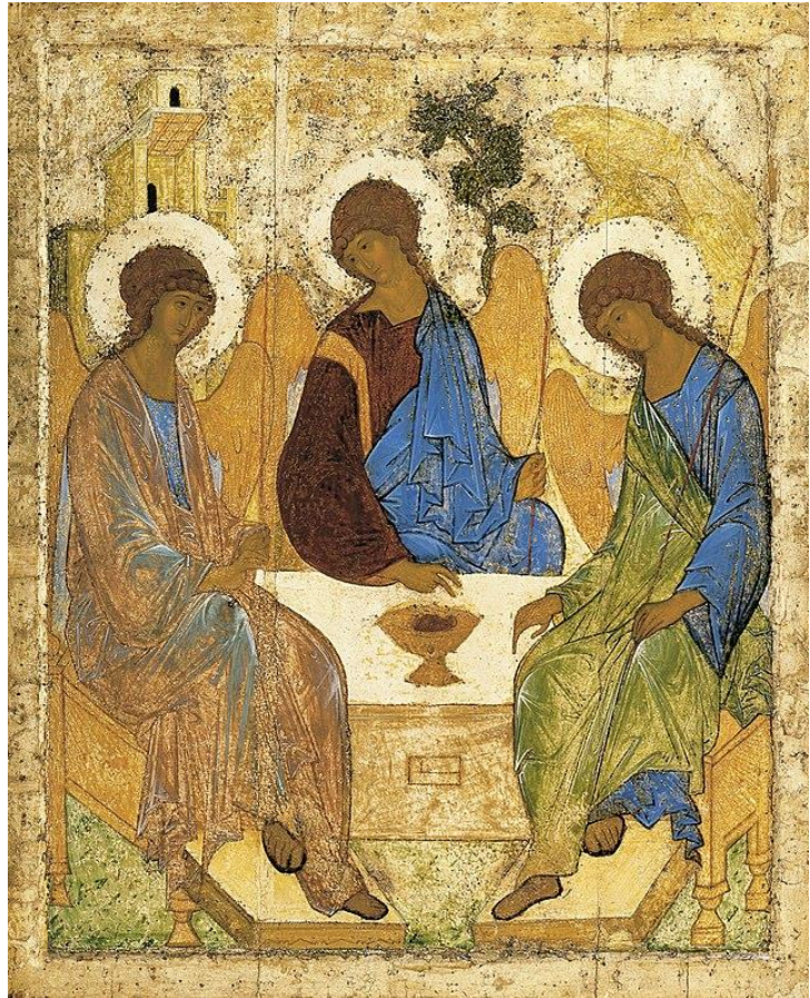
~ Andrei Rublev, "Trinity". 15 th C.

God to enfold me, God to surround me, God in my speaking, God in my thinking. God in my sleeping, God in my waking, God in my watching, God in my hoping. God in my life, God in my lips, God in my soul, God in my heart. God in my sufficing, God in my slumber, God in mine ever-living soul, God in mine eternity.