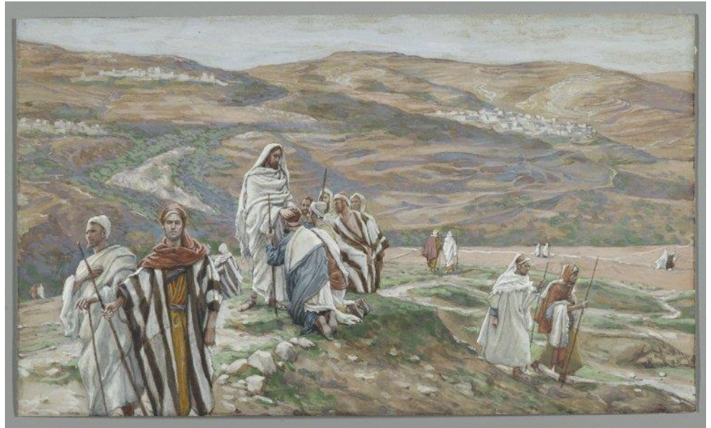
~ James Tissot, "He Send them Out Two by Two", c.1886-1894, Brooklyn Museum, Brooklyn, NY.

"Dear Christians, we are all the new creation. The world will not be renewed without us. We are responsible for the renovation of the world. Since the day of his resurrection, Christ's kingdom has been in the midst of humanity. The kingdom of God is already being built on this earth. To preach a church with only the hope of an afterlife is to falsify the kingdom of God. The kingdom that Christ preached and established is precisely that creation of his breath. It is made up of those pilgrims who traverse the earth with the responsibility of transforming history into the kingdom of God. We do not aspire to temporal power. Rather, in the face of the abuses and undesirability of this power, these pilgrims look to the church, which has the great responsibility to sanctify all human institutions...The church only needs hearts converted to Christ, purified like clean vessels so that the new life Christ initiated might descend upon them."