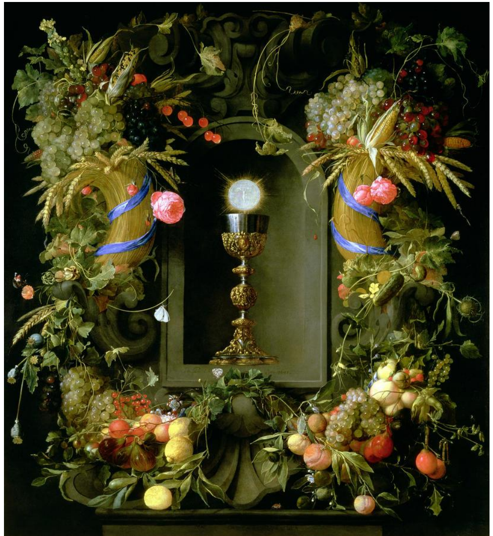
- Jan Davidsz de Heem, "Eucharist in Fruit Wreath", 1655-60, Kunsthistorisches Museum, Vienna.

Come, then, O lovers of Christ, and in our mouths of clay but with pure hearts let us receive in faith, the Passover that is sacrificed and offered in our midst.