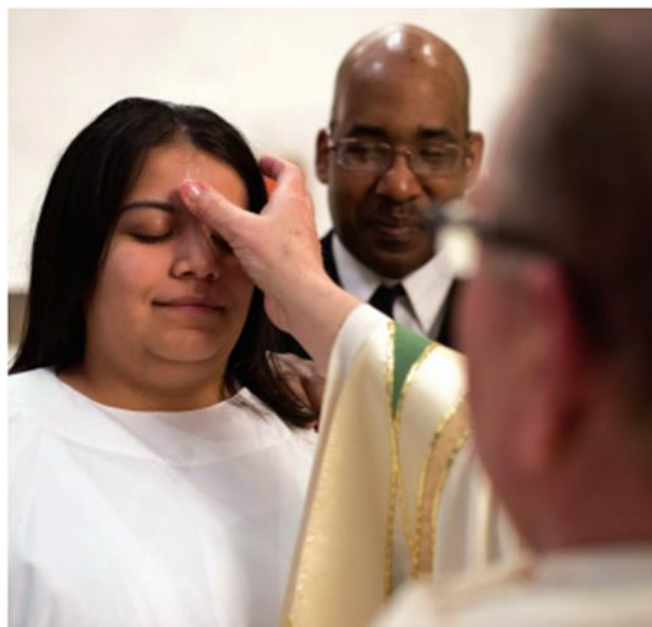
The reception of Baptism, Confirmation, and Eucharist at one liturgy highlights their connection to each other.

You may have noticed that the architecture in many churches reflects the connection of the sacraments. Often when we enter a church, the baptismal font from which we bless ourselves, remembering our Baptism, is directly across from the altar. We can easily see that Baptism leads to the table of the Lord, from which we receive the Eucharist. Having received the Eucharist, we are sent forth in mission to do God's work in the world.